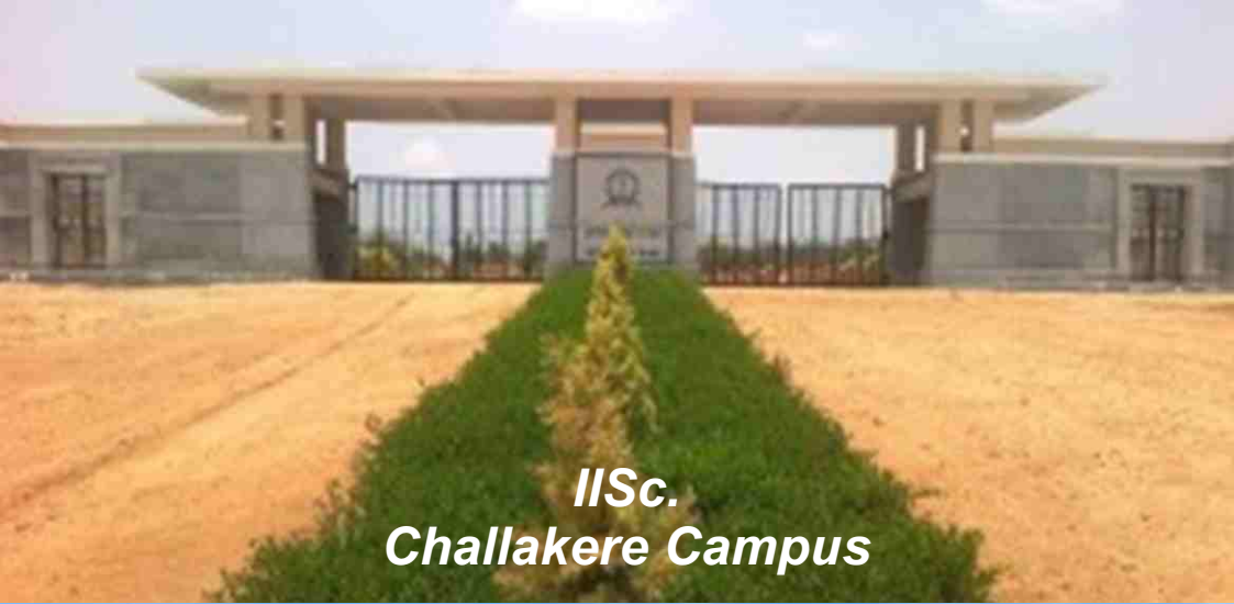
IISc. Challakere Campus